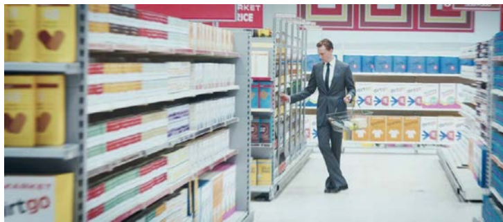
Figure 1: A still from the movie, High-Rise (2016), directed by Ben Wheatley.

A very telling example is the relationship between everyday life and the surroundings. In the case of modernism, the movie, High-Rise (Figure 1), a film adaptation of J.G. Ballard's novel, points to the mall as an icon of modern life [2].