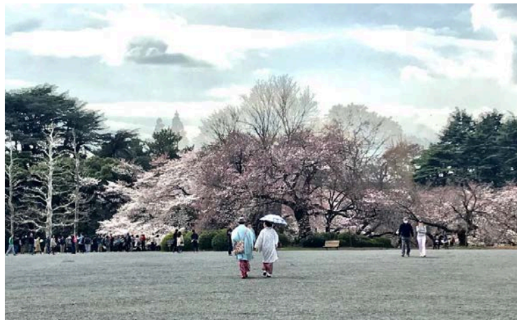
Figure 3: Tokyo, 2018.

Meaning has become a paradigmatic problem for postmodern architecture and of understanding everyday lives. The aesthetic elitism of modern architecture, the failure of it to deliver social progress and, above all, the increasing prosperity of the United States middle class has generated a need for meaning - a need for something different. Everyday activities are understood in this paradigm as rituals: activities that have a personal meaning for the user. An illustration of this is the return to tradition in many cultures of the world. An example is the custom of dressing in traditional clothes by Japanese during the cherry blossom festival in Tokyo (Figure 3). Residents take pictures of themselves in traditional costumes in a Tokyo city park: an illustration of a postmodern clash of tradition and the digital age.