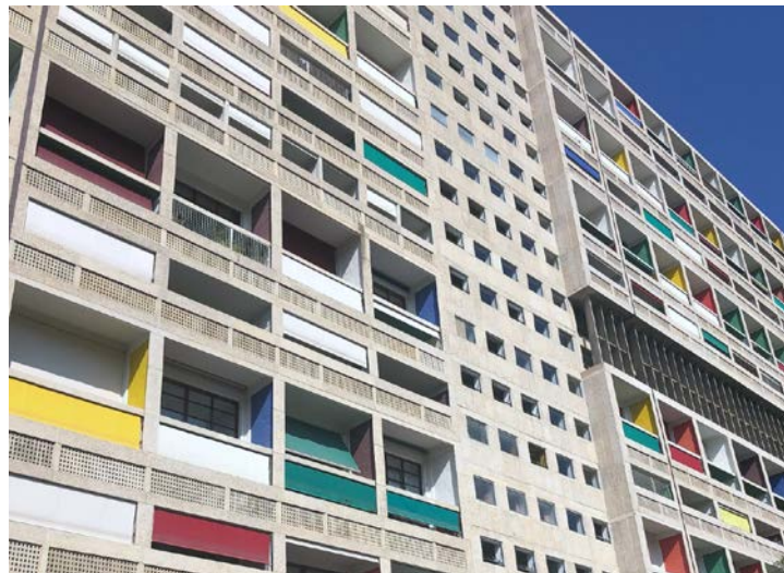
Figure 2: Unité d'habitation , Le Corbusier, 1945.

This image portrays a fast, effective life and the modern architecture that creates the experience. This contrasts with the image known to every student of architecture: the Unité d'habitation by Le Corbusier (Figure 2). The purpose of the comparison is to indicate the impact of architecture on the everyday lives of its users. It is important for students of architecture to recognise the impact of the architectural space that architects design on the experience of users of that space.